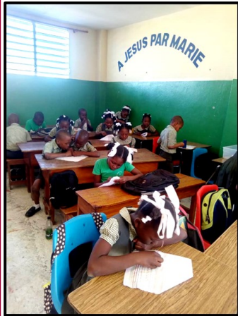
La Fraternité Primary School Port au Prince, Haiti